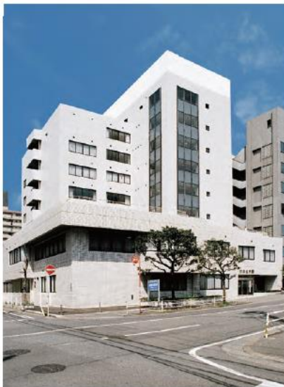
Hakata campus of YJC

The campus of YJC locates in Fukuoka city, the administrative, economic and transportation center of Kyushu. Fukuoka city has a large population (about 1,623,000), but is famous for its livability. Fukuoka's living cost is much cheaper than of Tokyo or Osaka. The public transportation systems are stretched all over the city, and the center of it is JR Hakata Station. Only 7 minutes' walk from Hakata station brings you to Hakata campus of YJC.